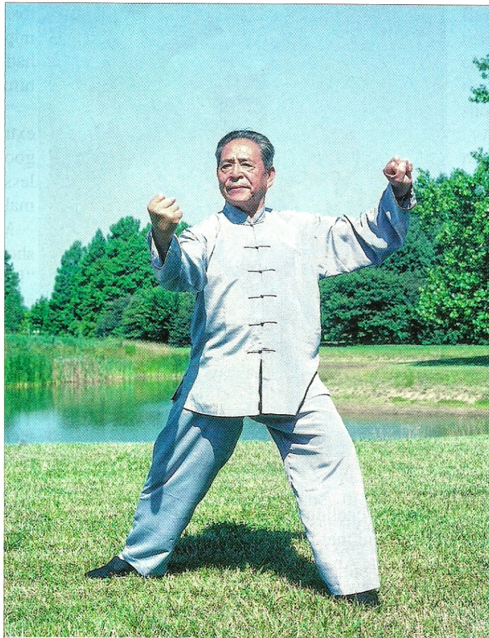
Yin Fu Cannon Fist

The young wrestlers then lined up in single file like a train and the first one on the line put both hands on Master Feng's abdomen.